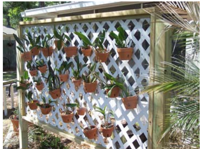
Viveca's new orchid trellis

News Update. Since our visit, Mitch has been busy! Here is the new orchid trellis designed to hold a bunch of orchids. You can see Viv has repotted them all into clay orchid pots. By summer, all the orchids should be in an orchid frenzy with blooms soon to follow! You may notice that the new trellis is already at about 60% capacity. Think it has something to do with the raffle table?