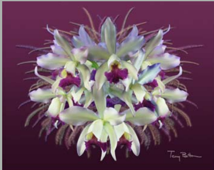
Orchid Explosion by Terry Bottom