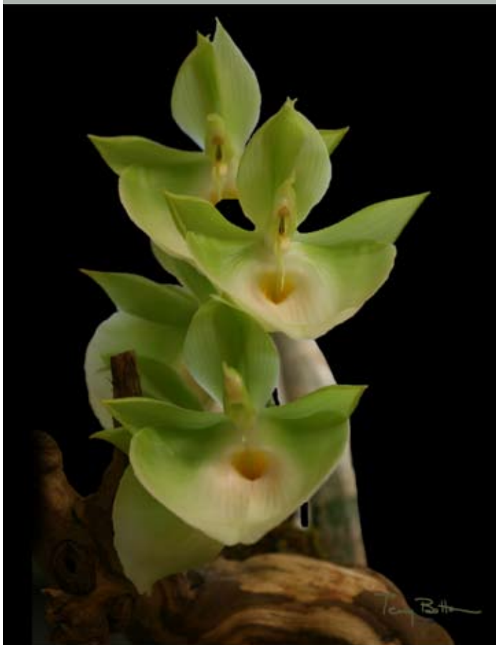
Ctsm. pileatum 'Jumbo Green Gold' by Terry Bottom