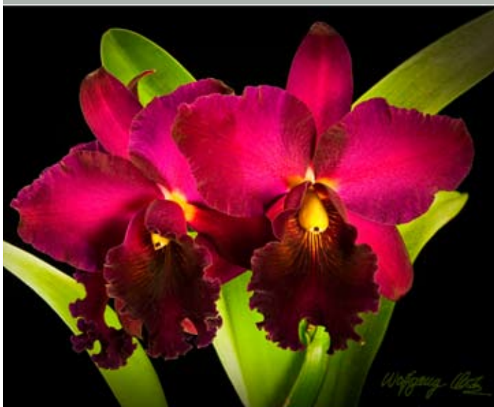
Lc. Waianae Blaze 'Sweetheart' by Wolfgang Obst