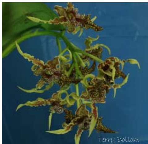
Grower Sue Bottom Den. spectabile