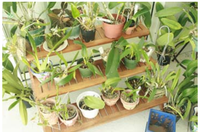
Maria utilizes a kit shelving system

Maria is planning her spring repotting marathon. She has orchids she's gotten from different vendors, the SAOS raffle table and auction, orchid shows, etc. and the plants are potted in a variety of potting mixes. Some plants are in sphagnum, some in cocohusk, some in bark and some in a coarse aliflor mix. This means that if she waters them all at the same time, some will be watered too frequently and some not enough. There just aren't enough hours in the day to evaluate each pot individually and see if it needs to be watered.