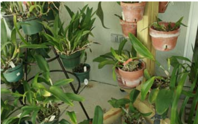
Maria makes maximum use of floor space

For winter protection, Maria stacks her plants in against the house wall and can close the hurricane sliding wall to isolate her plants from the outside cold air. Maria benefits from the microclimate provided in Butler Beach given that the Ocean and Intracoastal are heat sinks that keep the thermometer a couple degrees warmer than areas further west. She's also got a pool in the screen enclosure and that's another heat sink, particularly when she turned the pool recirculating pump on thereby raising the temps another couple of degrees. She needed it all during the cold, gray and wet weather this winter and her plants survived and are ready for warmer weather.