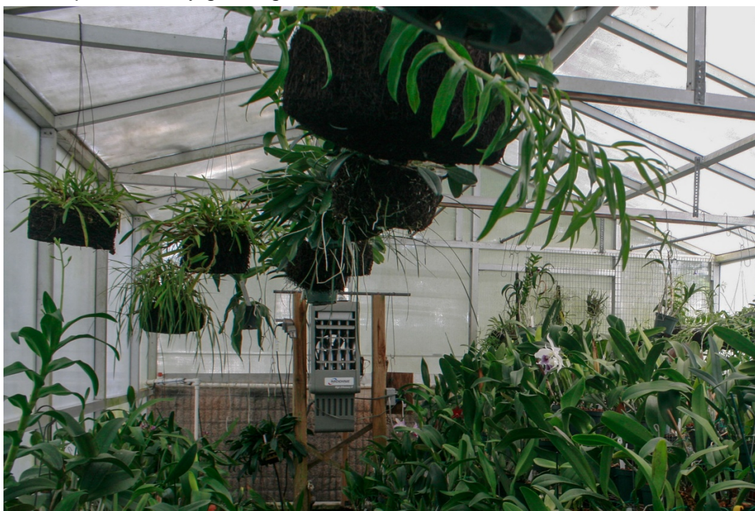
Mary Hollingshead grew many different types of orchids in her smallish greenhouse, including many dendrobiums in tree fern baskets.

My orchid club got a phone call one day, were we interested in buying an orchid collection? Mary Hollingshead was an orchid grower in Jacksonville who died unexpectedly. When we went to her greenhouse to look around, we found a lot of well grown plants by an obviously experienced orchid grower. We learned a lot just by looking at her plants, realizing she had picked up many tricks on how to best grow her plants with interesting and new (to us) ways of staking and propagating them. She had lots of specimen sized plants, many growing in tree fern baskets.